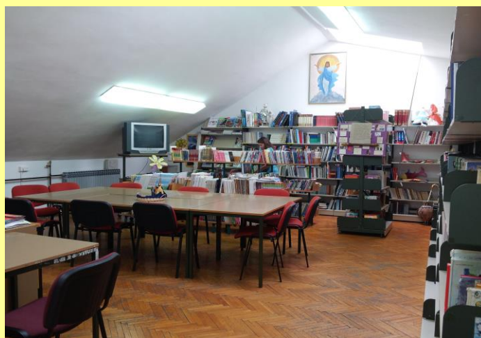
The school library, on the third floor of the school building

Today, there are 700 pupils in our school. Even though our school is old, we have got everything we need. The building has got two floors, an attic and 18 classrooms. There is also a small gym, a library and a staffroom. The school library has a large collection of books. Pupils like to spend time there and talk to the librarian. A lot of teachers work at school and they teach different subjects. They are kind and friendly to their pupils. We have a small garden in front of the school. There are some flowers in the garden.