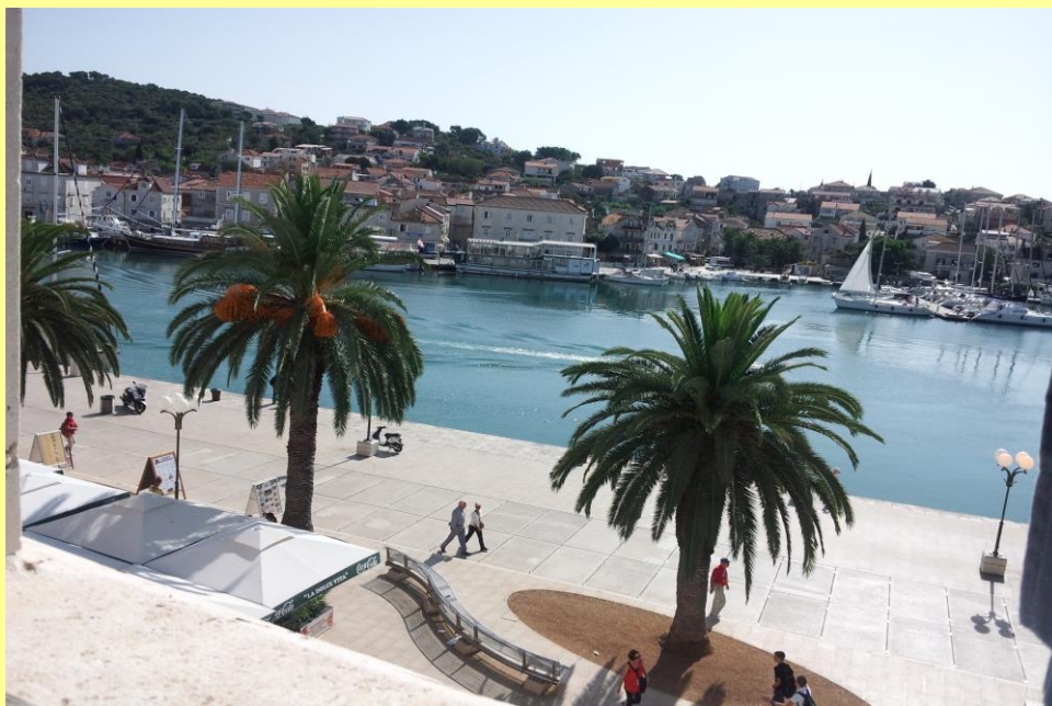
The view of the seafront from the Biology classroom

Pupils can also join the school sports club or the school choir. There are also classes called Young Historians, Young Chemists, Young Mathematicians and Drama group. Pupils attend these classes because they want to learn something more, take part in projects and competitions.